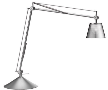
FU036800B Aluminized Silver