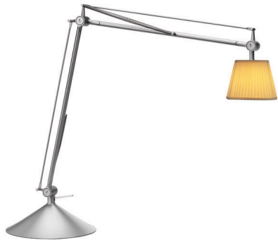
FU037300AB Plisse Cloth