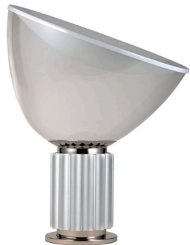
FU660004 Anodized Silver